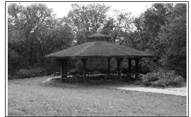
CRAB APPLE SHELTER (Upper Shelter)

Accommodates 75-100 People Lighted and handicap accessible Picnic Tables Electrical Outlets Handicap accessible Water Fountain Grills