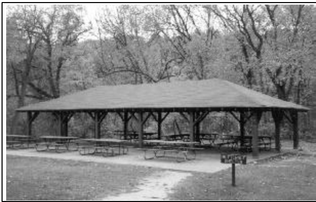
BUTTERNUT SHELTER (Lower Shelter)

Thank you for reserving a park shelter with the Ames Parks and Recreation Department. For your enjoyment and convenience, the information below highlights points of interest. If you have questions or special needs, please telephone 239-5350.