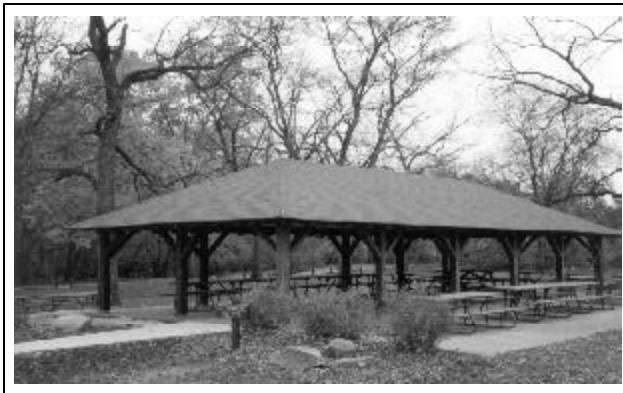
COTTONWOOD SHELTER (East Shelter)

Thank you for reserving a park shelter with the Ames Parks and Recreation Department. For your enjoyment and convenience, the information below highlights points of interest. If you have questions or special needs, please telephone 239-5350.