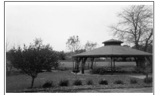
HAWTHORN SHELTER (West Shelter)

Accommodates 75-100 People Lighted and handicap accessible Picnic Tables (10) Electrical Outlets (16) Handicap accessible Water Fountain Grills